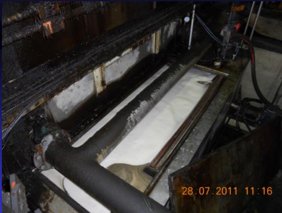
Surface stage 1 cleaning.